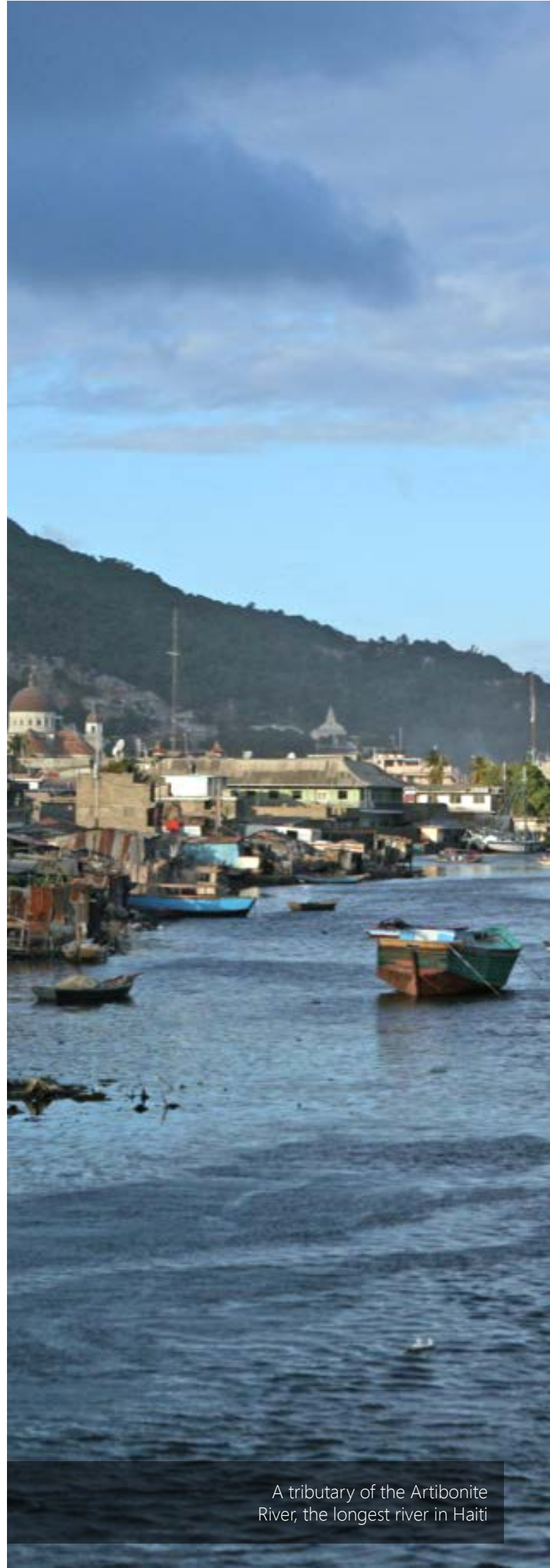
A tributary of the Artibonite River, the longest river in Haiti

However, surveillance and WASH investments planned under the New Approach are significantly underfunded and progress has been stagnant. In 2017, the latest data from the Direction Nationale de l'Eau Potable et de l'Assainissement (DINEPA) showed that 72% of the Haitian population did not have access to adequate sanitation and 42% did not yet have adequate access to safe water. 96 In this context of ongoing extreme vulnerability, the risk of a new cholera outbreak remains real.