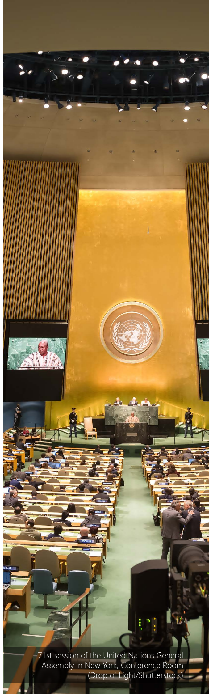
71st session of the United Nations General Assembly in New York, Conference Room

The UN’s response in Haiti reflects a systemic failure of accountability in the UN system. The UN has never established a standing claims commission in any country where it has had a peacekeeping mission, 42 despite signing agreements - like the SOFA - that provide for commissions in the event of a dispute. It additionally has not successfully established any accountability mechanism based upon its legal liability to remedy victims adversely affected by its missions. 43