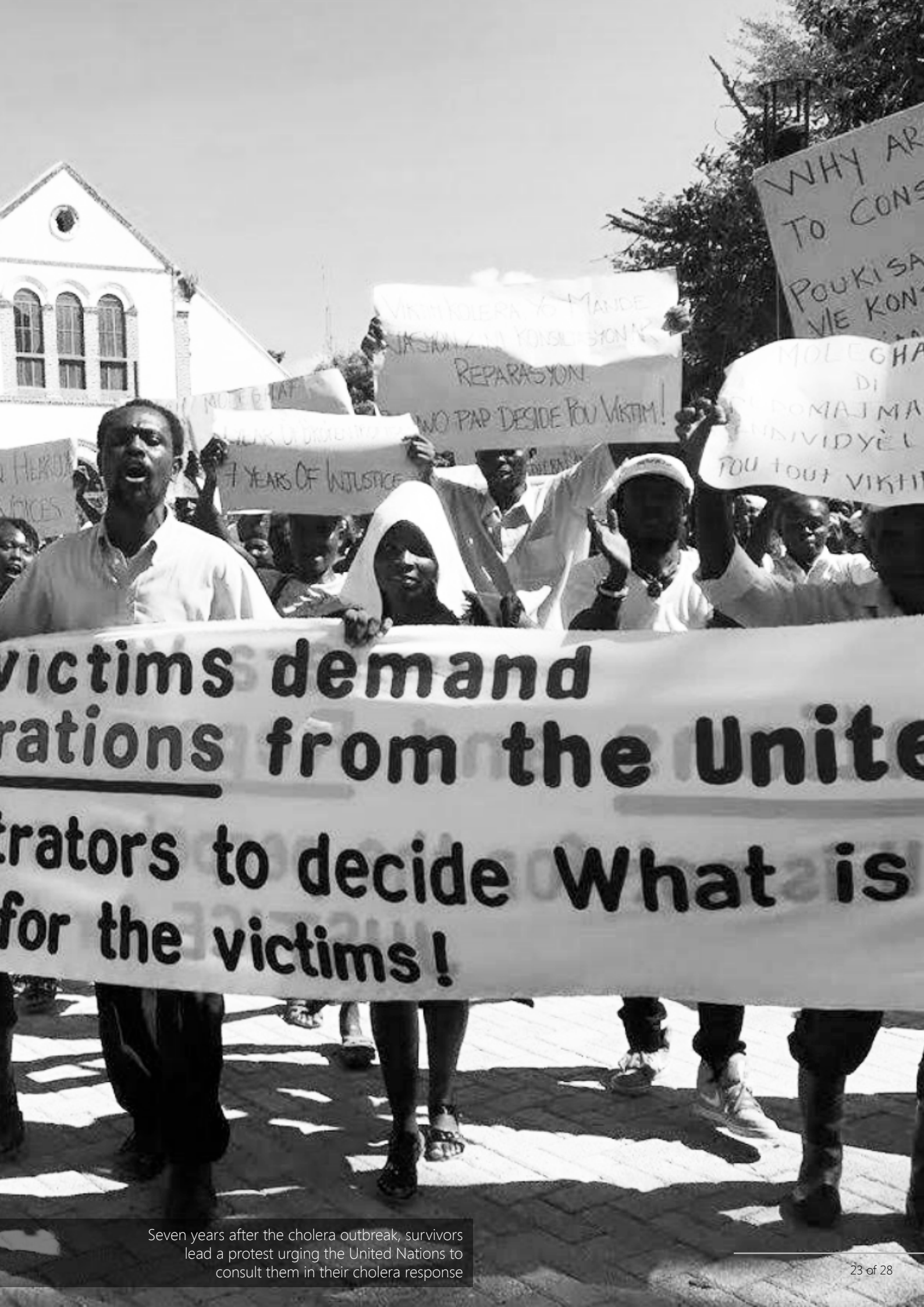
Seven years after the cholera outbreak, survivors lead a protest urging the United Nations to consult them in their cholera response